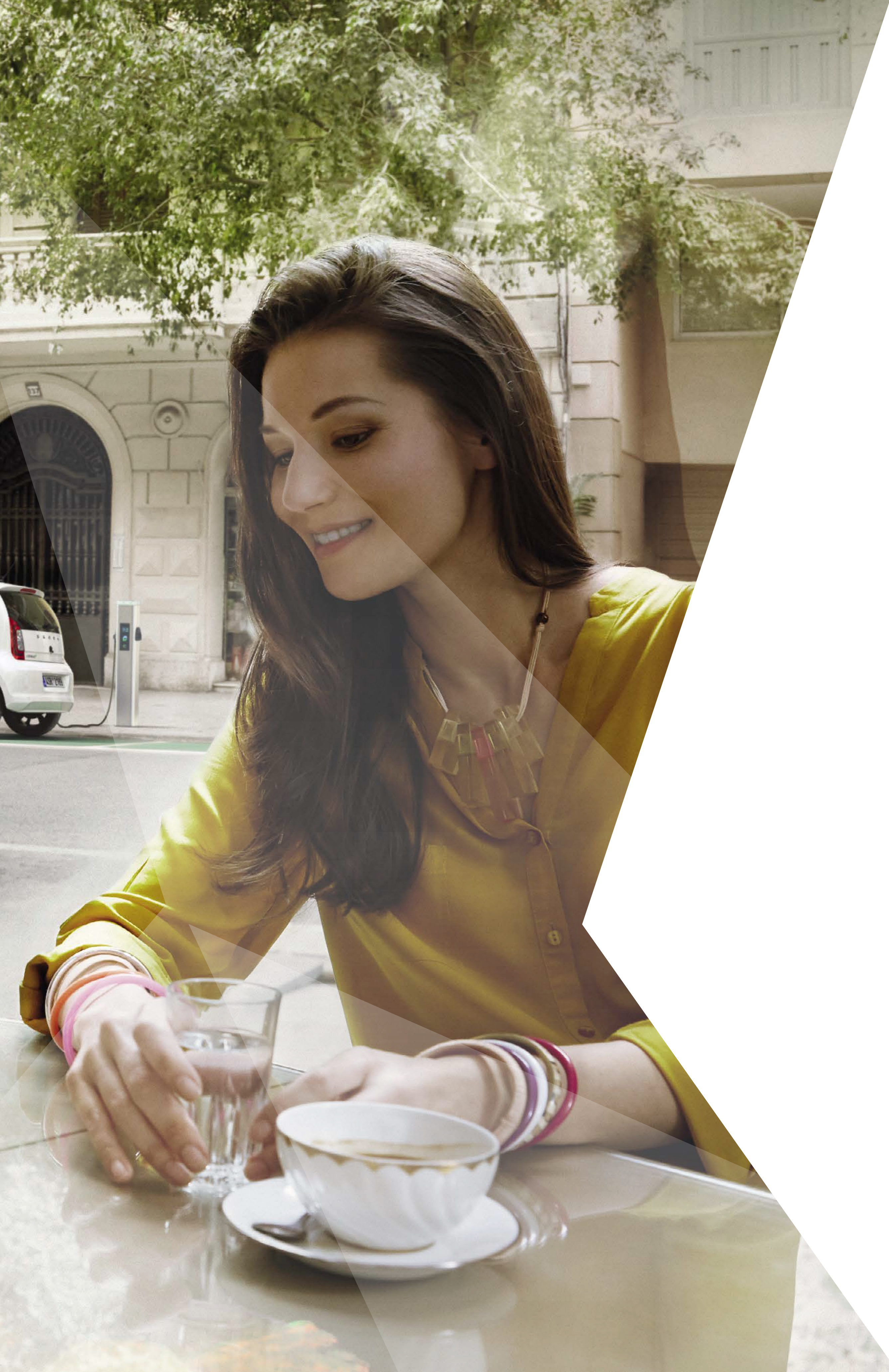
Deposit As little as one monthly payment