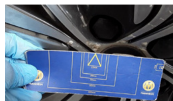
Charges applicable to over 50mm. Image 2 shows 40mm which is within tolerance.