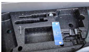
In the above image the tyre inflator is missing.